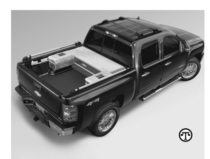
The 2007 Chevy Silverado Crew Cab can be fitted with an assortment of cargo accessories.

For a complete list, visit www.chevrolet.com or www.gmc.com.