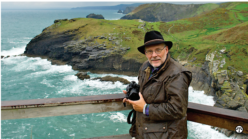
National Geographic photographer Jim Richardson offers photo tips for your next vacation.

A great photo can happen anywhere at any time, and now those vacation shots can land one person the ultimate vacation: a trip for two to the Greek Isles with National Geographic Expeditions and the chance to be featured in National Geographic magazine in an ad for Energizer® Ultimate Lithium batteries.