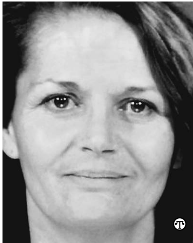
Before meth use.

According to a survey taken in 2004, an estimated 12 million people in the United States ages 12 and older had tried meth at least once, and 1.4 million of those had used it within the last year. In addition, law enforcement agencies nationwide ranked meth as one of the top drugs responsible for increasing violent crime rates in communities, according to a 2003 National Drug Intelligence Center survey.