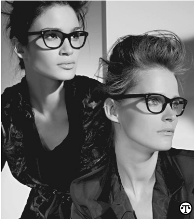
Yves Saint Laurent