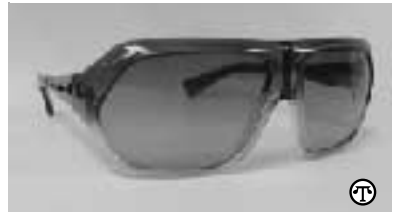
Updated aviators soar from Diesel.