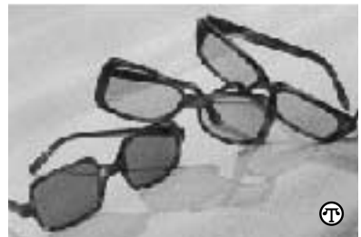
A bouquet of blue, violet and pink tinted shades from Kate Spade.