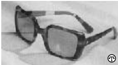
Flashback to the 60s with these Kate Spade shades.