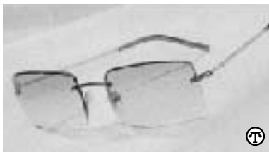
Shades without borders from Gucci are totally rock star.