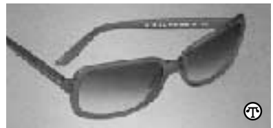
Bi-gradient color is hot, as in these lenses from Ralph.