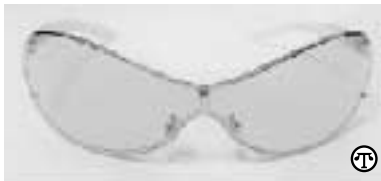
Fashionably futuristic include these Ralph Lauren shields.

• This season, it's okay to flaunt it and wear crystals during the day. Rhinestone-covered temples from Christian Dior and logo-encrusted lenses from Gucci epitomize 80s opulence.