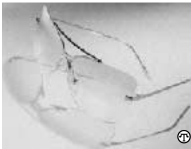
Flash mirror is the hottest trend in lens options by Christian Dior.