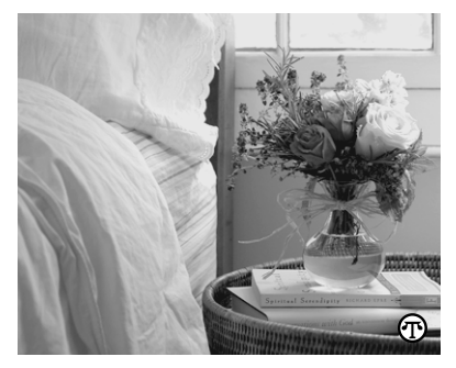
Start the day with flowers. Place a bouquet by your bedside so they're the first thing you see.