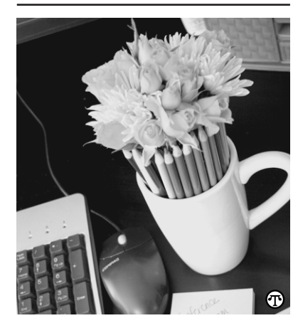
There's nothing like the splash of color provided by fresh flowers to brighten time at your desk.