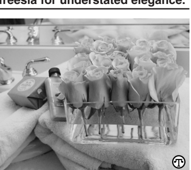
Freshen your bathroom with this innovative display of flower buds.