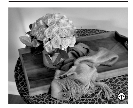
Revive a veranda with a bouquet of blooms set on an inlaid table.