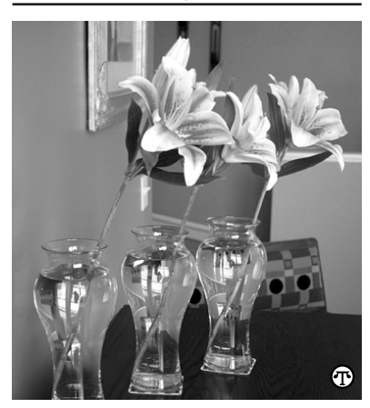
In a hall, place three single stems of the same flower in three symmetrical identical glass vases.