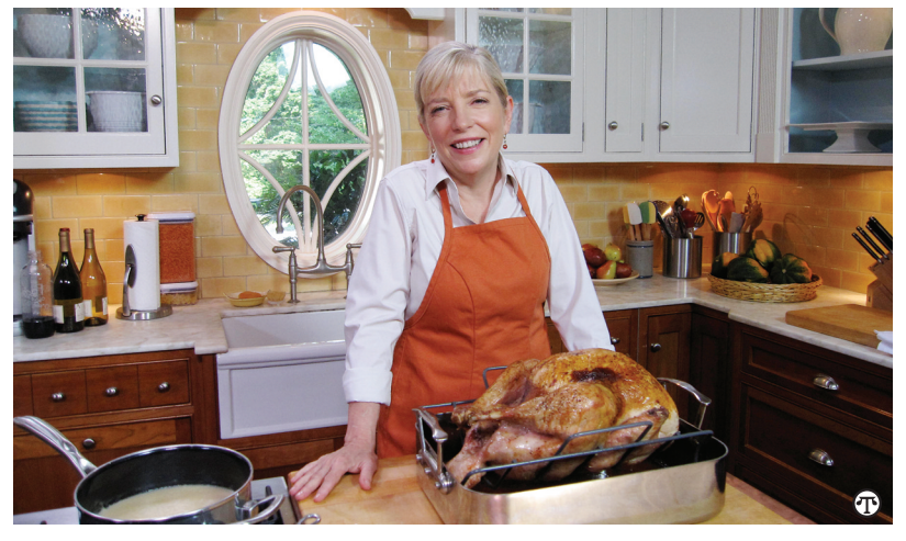
TV chef Sara Moulton, pictured here on set, recommends making side dishes in advance to reduce stress.

In medium saucepan over moderate low heat, melt butter.