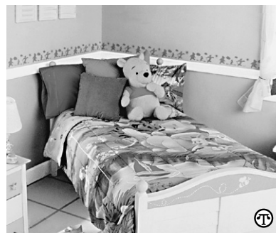
New child-inspired color palettes can help kids brush up the appearance of their rooms.

3. After the stepstool has dried thoroughly, decorate with the Bee Stamp, from the Disney Home Collection. Apply "Sunny Spot" on the surface of the Bee Stamp with a sponge stencil brush. Use only a thin layer of paint, evenly distributed on the stamp.