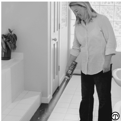
A spray-on sealer can protect tiles from stains and spills.

2. Next, sweep or vacuum the room to make sure the tiles can adhere to a flat, clean surface. If you are removing old tiles, “warm” one tile at a time using a heat gun and then use a putty knife to pry the warm tile. Repeat this process until the area is free of tile and old adhesive.