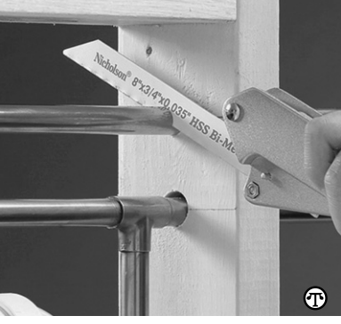
Jab Saw—The hacksaw converts to a jab saw that can make inside cuts.