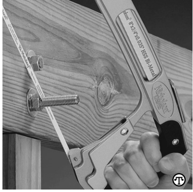
Flush Cuts—A flexible blade can be switched from the 90° configuration to a 45° one to allow for hard-to-reach flush cuts.

(NAPSA)—The right tool can help do-it-yourselfers keep simple jobs from turning into big projects. Here's a look at ways to use a new kind of four-in-one hacksaw to make a variety of cuts.