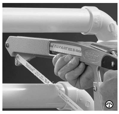
Tight Cuts—The front section of the frame flips up and out of the way of the blade so the saw can be used in tight spaces.

The tool, called the Nicholson® Pro Series 4-in-1 hacksaw, also has magnetic blade storage in its frame for the extra blade used in the jab saw configuration.